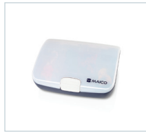
Ear tip box with eartips