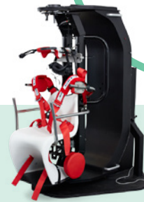
TRV Chair Diagnosing and treating Benign Paroxysmal Positional Vertigo (BPPV)