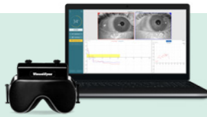
VisualEyes™ 525 Complete VNG solution for balance assessment